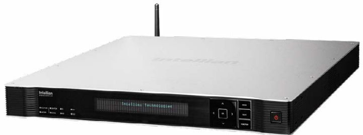
Antenna Control Unit (19" Rack Type 1U)